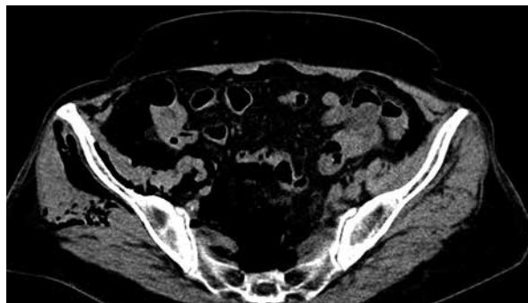
Fig. 2. Retroperitoneum